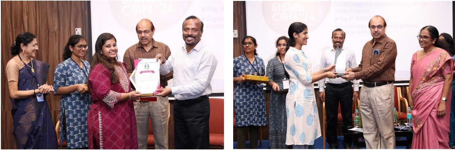
Fig: 4,5 Prize distribution for University Anatomy PG and UG toppers