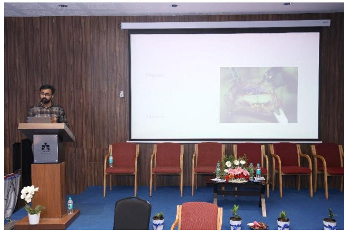
After the lunch break, we gathered for the general body meeting- ASI, Kerala Chapter, followed by prize distribution for Paper & poster presentations, felicitation of the judges with mementos and certificates.