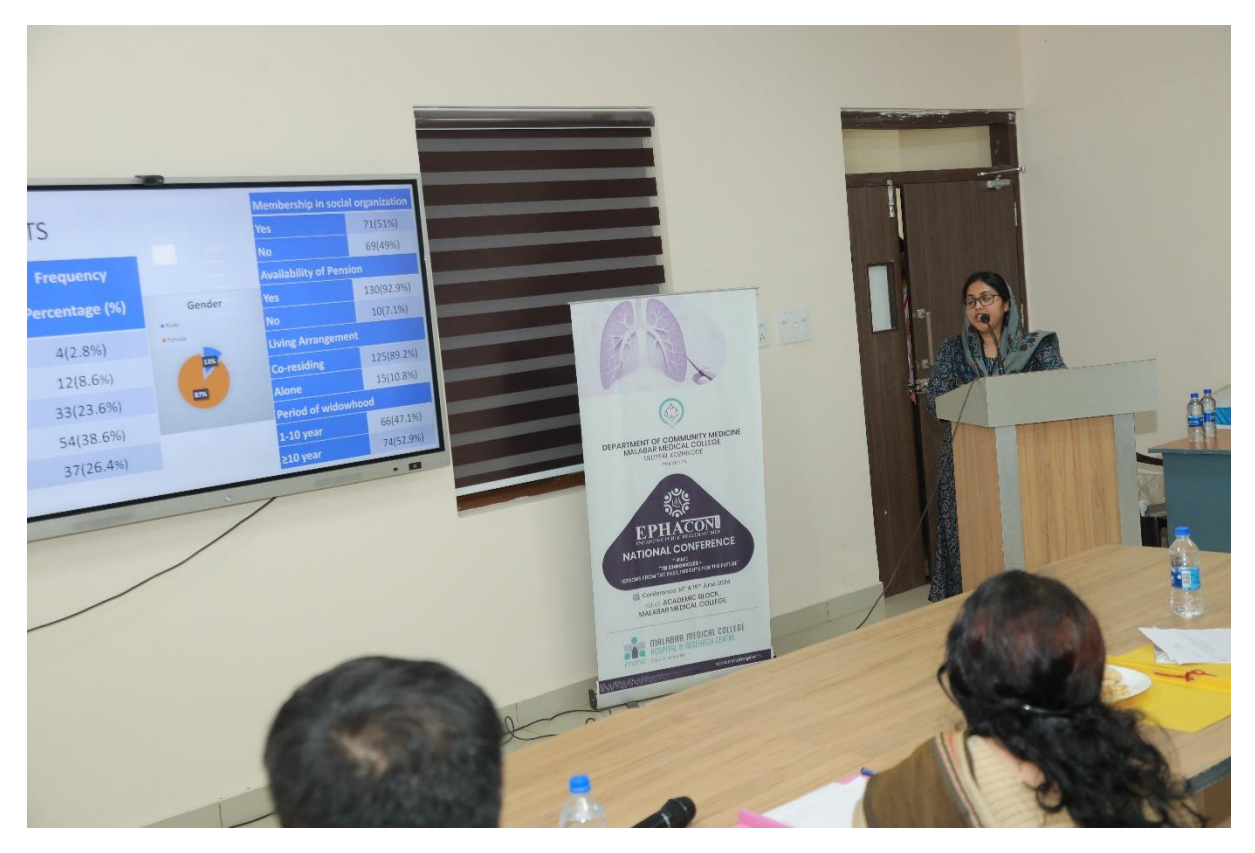
DETAILS OF RESEARCH PAPER AND POSTER PRESENTATIONS ON 14/06/24