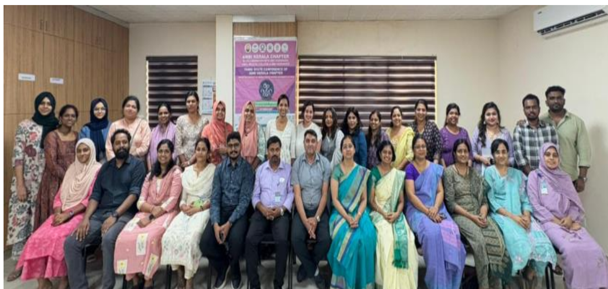
Fig. 1. The team consisting of the speakers, the organising team (Biochemistry department, MMC) and the delegate from across the state.

Pre-conference workshop held in MALABAR MEDICAL COLLEGE & RESEARCH CENTRE on the topic DECODING LAB DATA was attended by pre-registered group of 30 number of delegates from across Kerala. The workshop was attended both by post graduate students and faculty of Biochemistry .