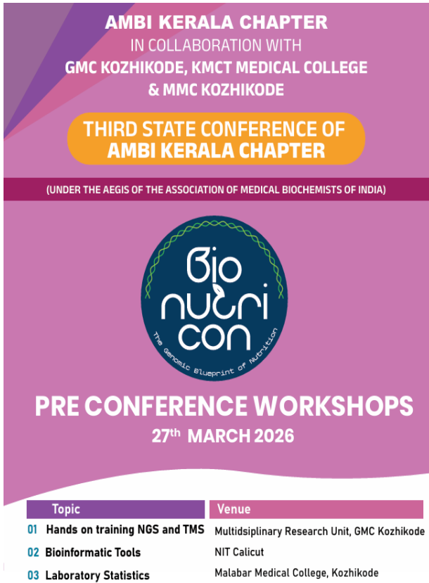
Fig.2 Pre conference workshop brochure.